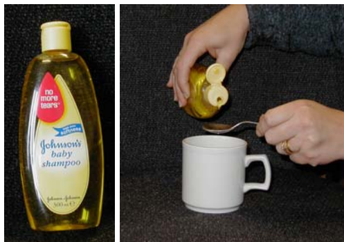
Put 1 teaspoon of baby shampoo in a cup of water