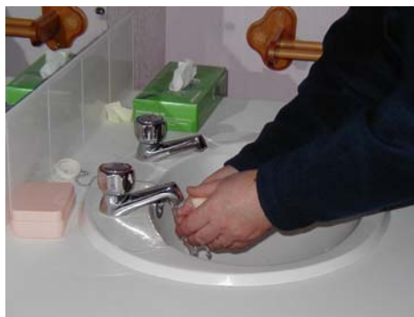
Wash your hands