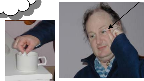
Use new cotton wool for the other eye