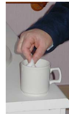
Dip the cotton wool in the diluted solution